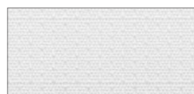
WARP TECH 8.88