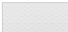
WARP TECH 9.88