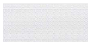
WARP TECH 6.88