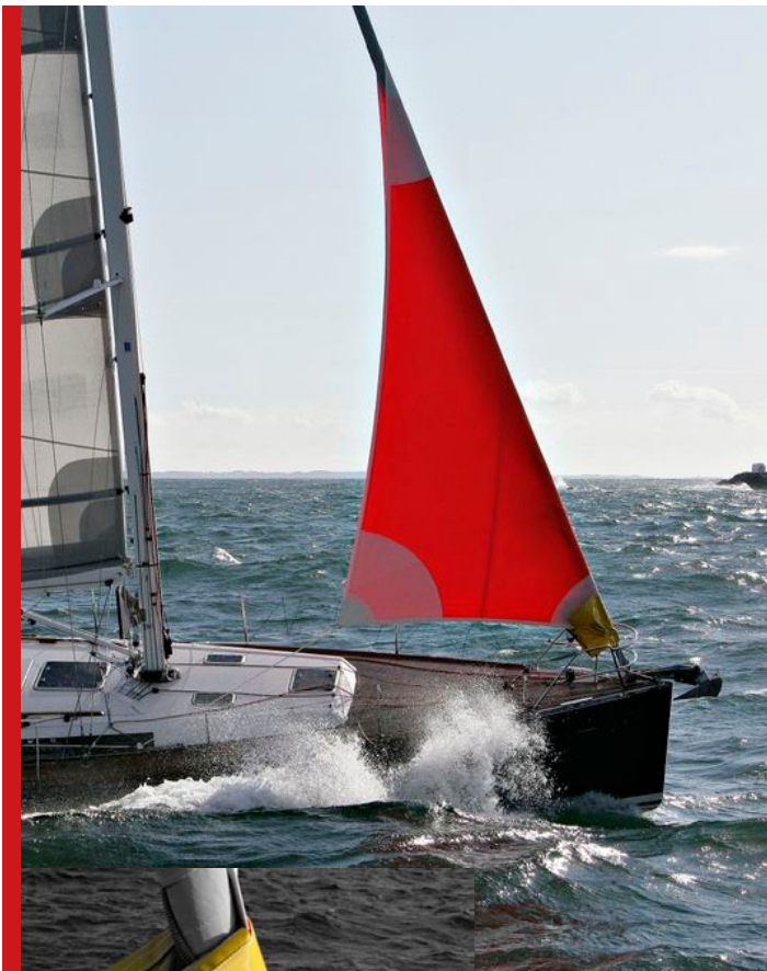
THE SPECIAL FURLING STORM JIB